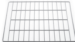
Wire Baking Rack