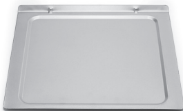
Removable Crumb Tray