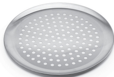
16-Inch Pizza Pan